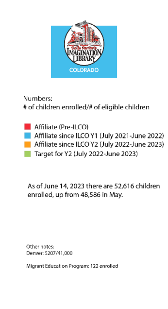
Table showing list of counties, estimated eligible population (young children ages 0-5) per county, and number of children currently enrolled in June 2023.